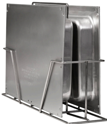
Accessory Carrier #0645-003