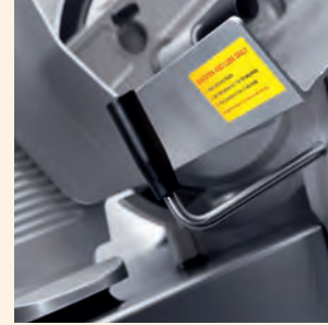
Remote sharpener, better food safety