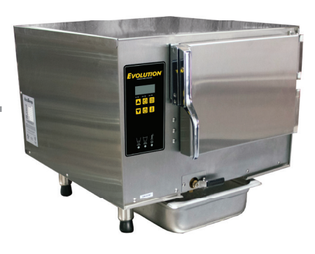
E3 Evolution™ Model shown with optional bullet feet and optional drain pan

Evolution<sup>™</sup> steamer is AccuTemp Products' connectionless, boilerless steam cooker that utilizes AccuTemp's patented Steam Vector Technology for faster cook times, improved energy efficiency, better pan to pan uniformity, and less water consumption. Steam Vector Technology requires no moving parts inside the cooking chamber. Steam to be produced inside the cooking cavity with no heating element exposed to water. No water or drain line. Uses less than 1.5 gallons of water per hour. Unit to include low water, high water, overtemp warning lights and auto shut off feature. Evolution<sup>™</sup> to include heavy duty, field reversible door. Standard digital controls with independent timer. No water quality exclusions to warranty and no water filtration or treatment required. Unit to be UL Safety and Sanitation Certified, and Energy Star qualified. Built in USA.