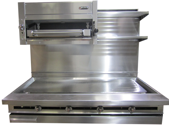
JTRH-60IP (shown w/range mounted salamander and a double deck tubular shelf)