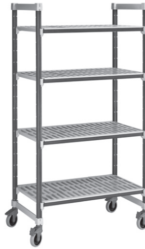
Mobile Starter Unit with 4 Vented Shelves