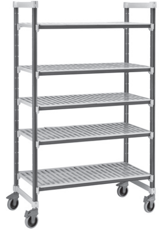
Mobile Starter Unit with 5 Vented Shelves