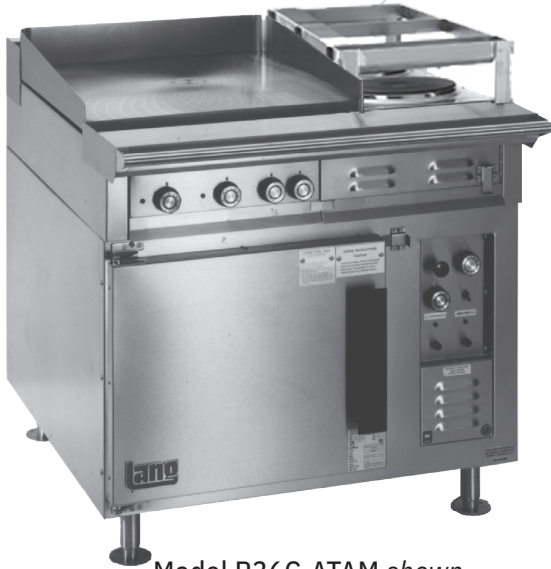
Model R36C-ATAM shown