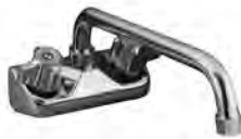
#303365 standard faucet