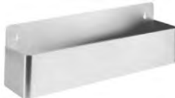
single-tier speed rail