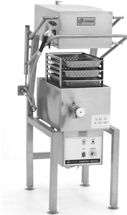
Model SKGL3-7 (with optional food pans)