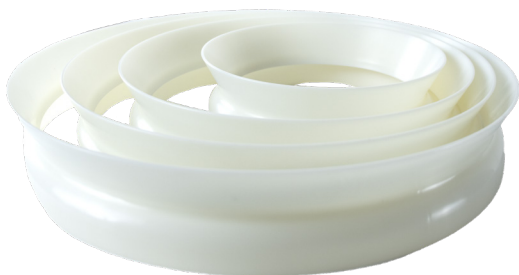
Sm ^ rt Rings | SR

Antunes and Agape Automation introduce Sm ^ rt Rings. Allowing you to apply cheese and toppings on pizzas at double the speed while cutting your waste in half, Sm ^ rt Rings streamline your pizza operation.