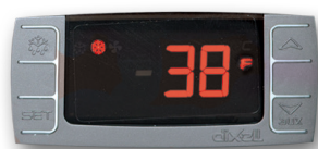
Adjustable Digital Thermostat! Easy to read exterior mounted