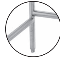
CROSS-BRACING Ensure Stability