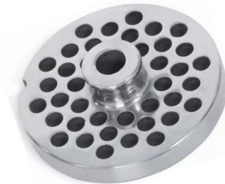
2 Plates Included (5mm & 8mm) Additional Accessories Available Upon Request

** Due to continuous product improvement, specifications are subject to change without notice.