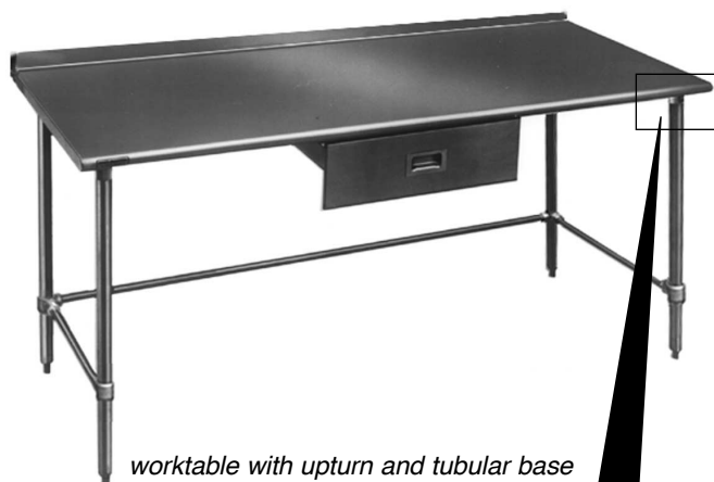
worktable with upturn and tubular base —shown with optional drawer

BlendPort® worktables, Budget series, model _____. Top constructed of heavy gauge type 430 stainless steel with 1½" roll on front, 1½" rear upturn, and sides turned down 90°. Open front with 1¼" O.D. stainless steel tubular crossbracing on sides and rear. Top reinforced with welded hat channels and sound deadened. Constructed with uni-lok® patented gusset system with the gussets recessed into the hat channels to reduce lateral movement. Legs are 1½" O.D. stainless steel tubing, with stainless steel gussets and 1" stainless steel adjustable bullet feet.