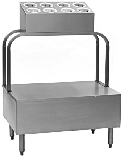
tray stand with optional silverware unit

Eagle Tray Stand, model TU-1. Top is type 16/430 stainless steel, with heavy gauge stainless steel cabinet base, 1 5/8" O.D. stainless steel tubular legs and adjustable stainless steel bullet feet.