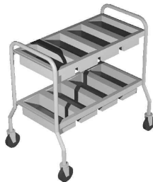
T-305 Capacity: 120 Dozen Cutlery Pieces Height = 2' 6-3/4"