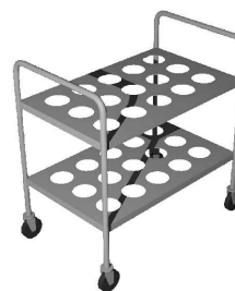
T-407 Capacity: 30 Cutlery Cylinders Height = 2' 10-3/4"

Provide bulk storage, transportation and dispensing in cafeterias, dining rooms, and banquet rooms for waiters or patron self service.