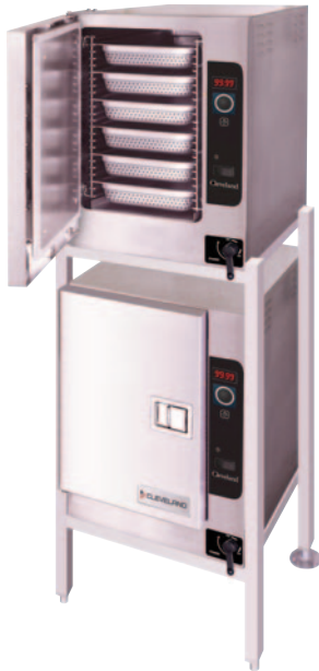
Shown with optional Cafeteria Pans