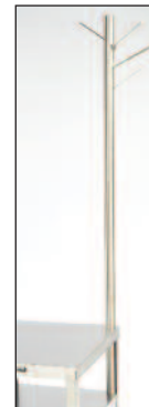
#8560 optional Accessory Storage Pole