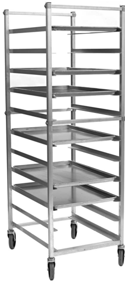
18 Series rack

Eagle Panco® 18 Series Deluxe Pan Rack, stainless steel model _____ . Stainless steel frame and cross supports are 1" square stainless steel tubing with all-welded construction. Slides are heavy gauge stainless steel, 1 7/8" with raised bead to minimize friction, riveted to vertical uprights. Slide spacing to be 5", 3", or 2 1/4" to accommodate (11, 18, 20 or 24) full size sheet pans. Units feature front-to-back and side-to-side crossbracing. Furnished with 5"-diameter swivel casters. Shipped assembled.