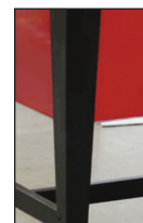
Optional Powder Coated Frame