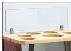
Optional Food Shield