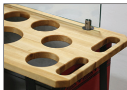
Optional Butcher Block Top With Optional Cutouts (Not NSF approved.)