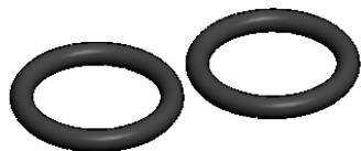
(2) Heat Resistant O-Rings