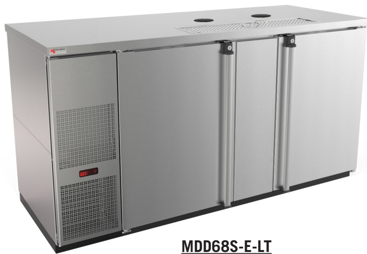
MDD68S-E-LT Stainless Steel