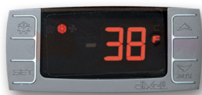
Adjustable Digital Thermostat! Easy to read exterior mounted