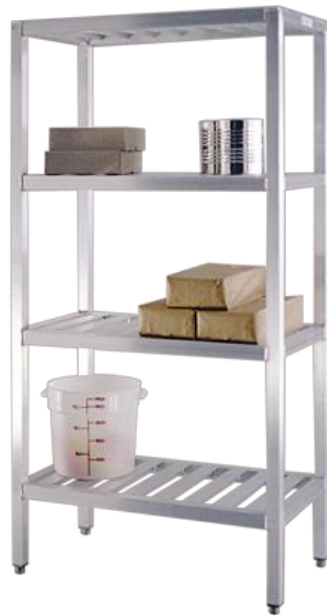
T-Bar Series Four Shelf Unit

All Welded T-Bar shelving offers a smooth, flat surface that also provides adequate air flow to stored items, making it ideal for coolers, freezers, and other walk-ins. The surface is easy to clean and allows boxes to slide on and off for smaller product with the strength to hold heavy product as well. Each end of every "T" is welded at three points for maximum strength and stability!