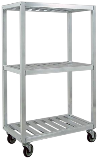
T-Bar Series Three Shelf Unit w/ Optional "M5" Casters Casters are factory installed only.