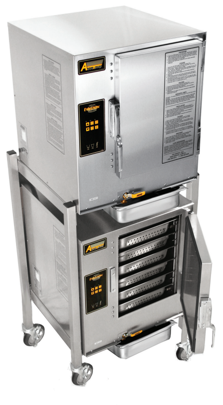
E6 Evolution Models shown with optional drain pan and stand with casters

Evolution steamer is AccuTemp Products' connectionless, boilerless steam cooker that utilizes AccuTemp's Patent Pending Steam Vector Technology for faster cook times, improved energy efficiency, better pan to pan uniformity. Steam Vector Technology requires no moving parts inside the cooking chamber. Steam to be produced inside the cooking cavity with no heating element exposed to water. No water or drain line. Unit to include low water, high water, overtemp warning lights and auto shut off feature. Evolution to include heavy duty, field reversible door. Standard digital controls with independent timer. No water quality exclusions to warranty and no water filtration or treatment required. Unit to be UL Safety and Sanitation Certified, and Energy Star qualified. Built in USA.