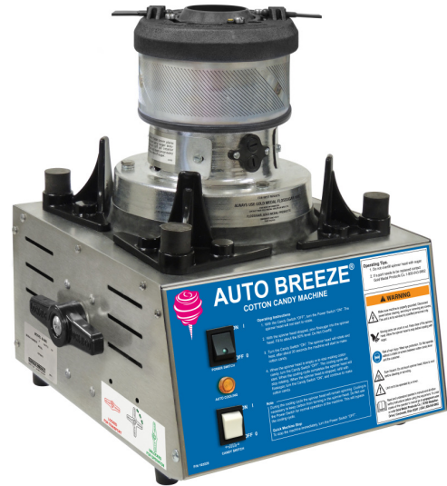
Unit view without Floss Pan