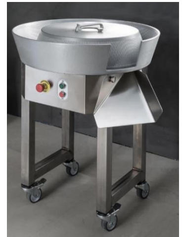
BMDBR3L Dough Ball Rounder with Legs

** Due to continuous product improvement, specifications are subject to change without notice.