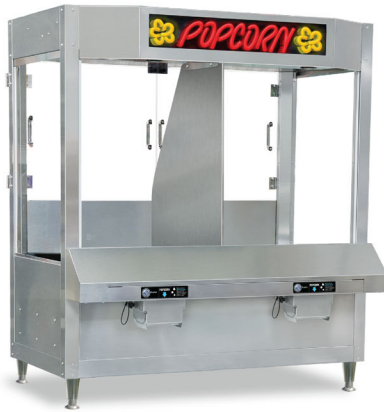
Countertop ReadyServe Model 2785 (002)