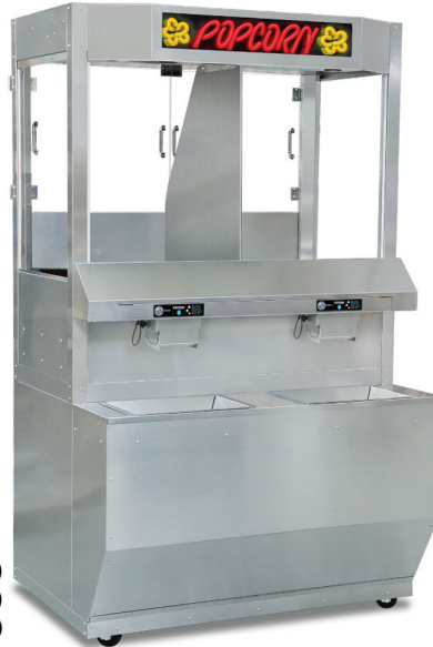
ReadyServe Model 2785 (002) shown on Base Model 2779 (011) (Base sold separately)