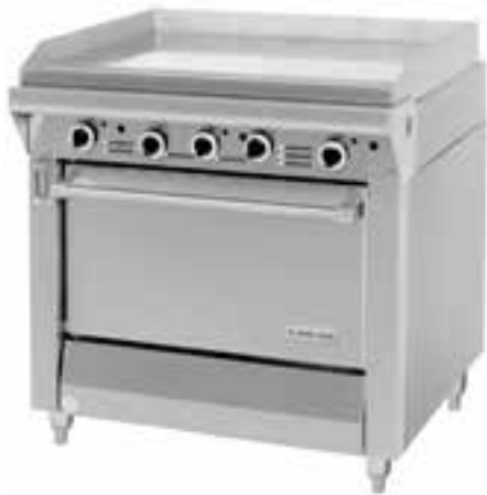
Model MST47R (valve control panel not as depicted) Valve Controlled Griddle Top Range