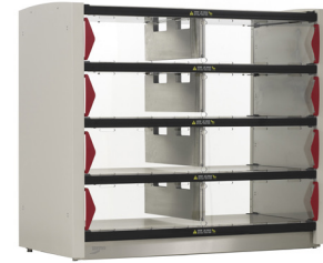
PU8CD-HS1842 8 Compartment order pick-up/staging station for pizza & other boxed items.

Consistent Heat Distribution: Metro2Go Hot Stations are constructed with Super Erecta Hot shelving. High quality, Type 304 stainless steel construction with aluminum inner core for consistent, reliable radiant heat across each shelf. Adjustable thermostat, 200°F (93°C) maximum surface temperature. Shelves are UL and NSF listed.