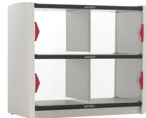
PU4CD-HS1842 4 Compartment order pick-up/staging station for bagged or boxed orders.