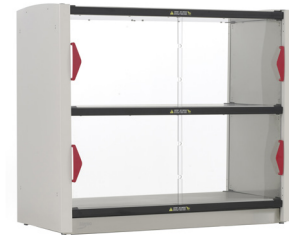
GG2CD-HS1842 2 shelf Grab & Go Station with doors.