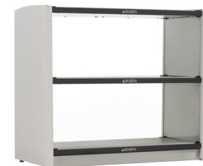
GG2C-HS1842 2 shelf open Grab & Go Station.