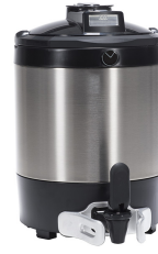
TF SERVER, 1.5G DSG GEN3 NOBASE