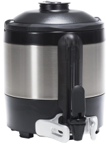
TF SERVER, 1G MECH GEN3 NOBASE