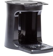
NON-LOCKING STAND ASSY, TF SERVER GEN3