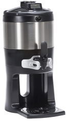
TF SERVER, 1G DSG GEN3