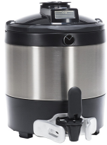
TF SERVER, 1G DSG GEN3 NOBASE