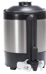
TF SERVER, 1.5G MECH NOBASE GEN3