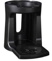
STAND ASSY KIT, TF SERVER