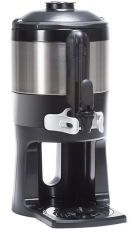
TF SERVER, 1G MECH GEN3