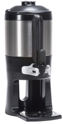
TF SERVER, 1.5G MECH GEN3