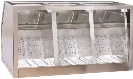
Customer Side (020 Series shown for general image reference only.)