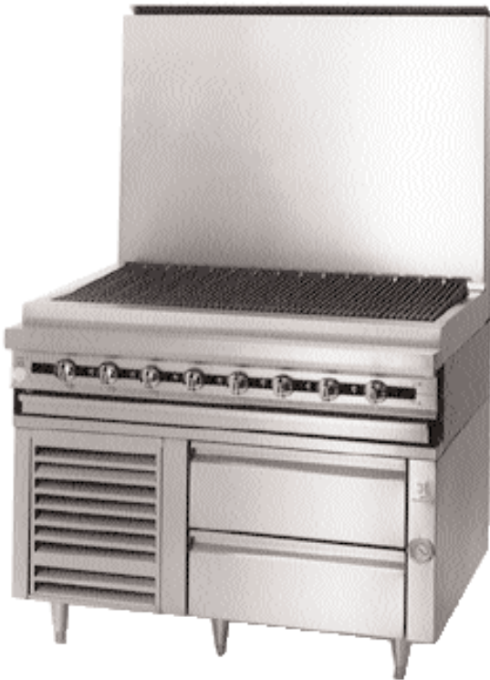
JRLH-02S-T-48 shown with JMRH-48B