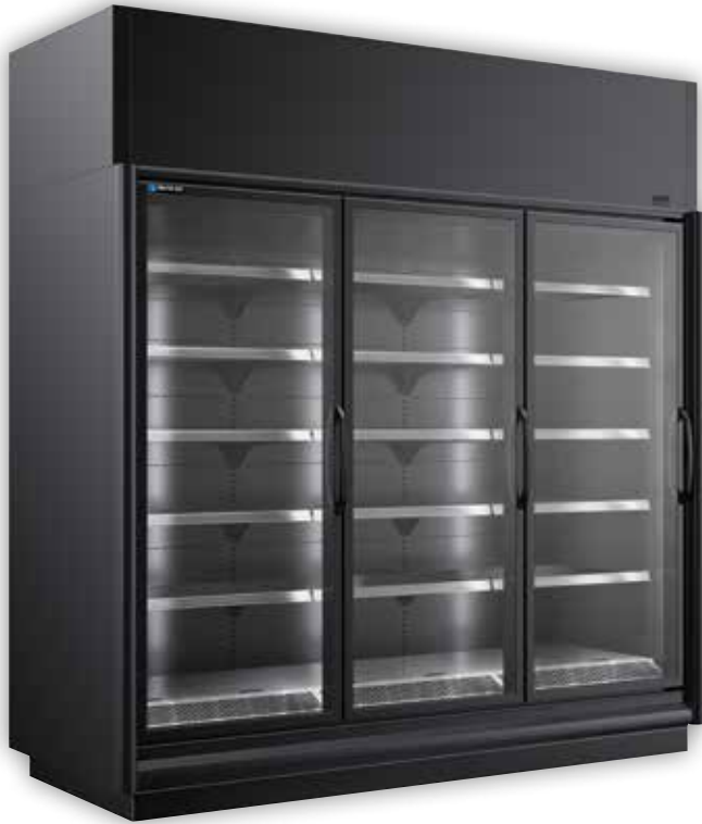
BEM-3-30SC/BEL-3-30SC (shown with ends installed and semi-self-contained refrigeration system)