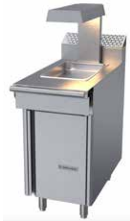
Model C18-FMD Shown as dump station with optional heat lamp