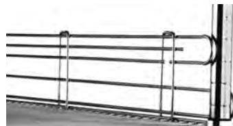
4" (102mm)-high ledge