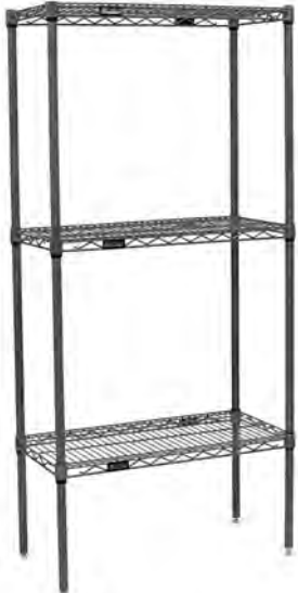
decorative three-shelf unit