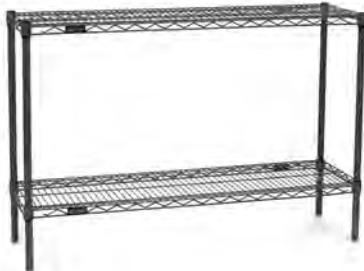
decorative two-shelf unit