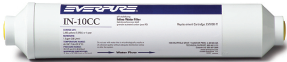
IN-10 CC: EV9100-71

Designed for great taste and odor reduction