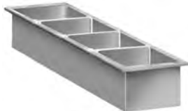
bottle holder tray