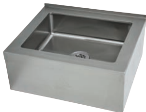
Cabinet Includes Floor Mop Sink