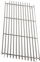
WIRE GRILL,DRIP TRAY (SINGLE)