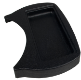
DRIP TRAY, TDO/TCD