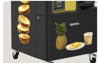
Isla is customisable

You decide what your Isla will look like. Our new model will quickly and easily adapt to your establishment. Customise the graphics and stickers to fully match the aesthetics of your business.