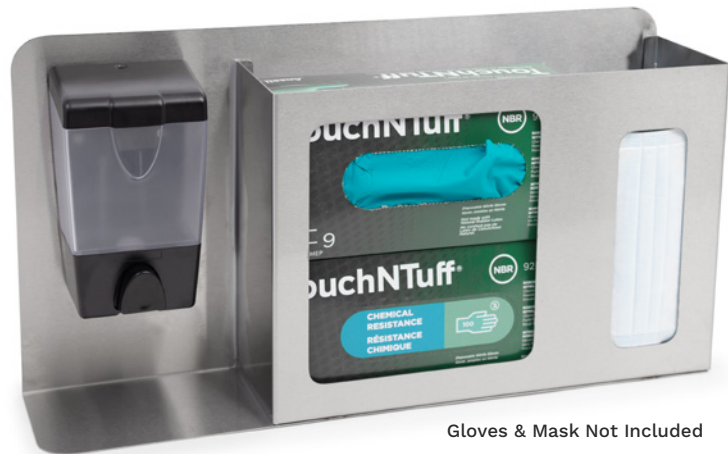
Gloves & Mask Not Included