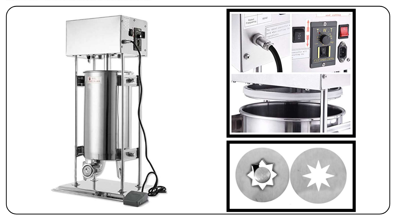
Product design may vary without notice.