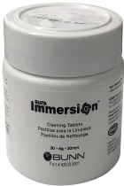
TABLET, CLEANING 1 JAR SURE IMMERSION