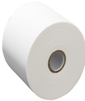
FILTER, PAPER 1 ROLL