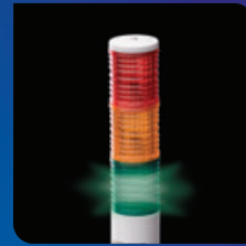
Optional Light Tower