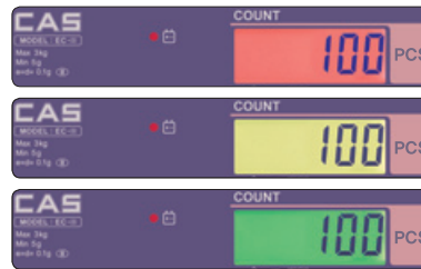
▲ Three backlight colors

Set the weight or count range and the EC-2 will indicate whether the actual weight or count is HI, LO, or OK, with alarm beep sounds and color display indicators. The optional Light Tower offers a larger visual alternative.