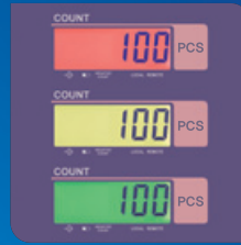
Three Backlight Colors