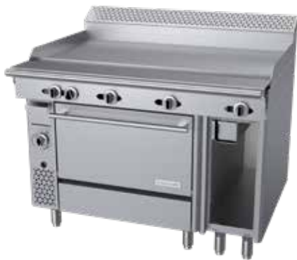
Model C48-1R Range with 48" Griddle, Valve or Thermostat Controlled