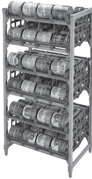
CPU243672C96 Premium Unit (with Cans)