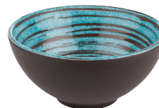
16 oz. Bowl Item No. APS 85205 D5 7 / 8 " H2 3 / 4 " 1 pc. / .57# • .06 cu. ft. SCC B852051