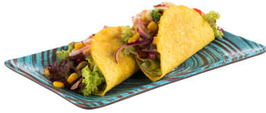
Rectangle Tray Item No. APS 85200 W5 3 / 8 " L9 1 / 4 " H 5 / 8 " 1 pc. / .69# • .02 cu. ft. SCC B852006