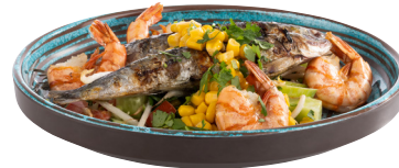
7" High Rim Plate Item No. APS 85202 D7" H1 1 / 8 " 1 pc. / .53# • .03 cu. ft. SCC B852020