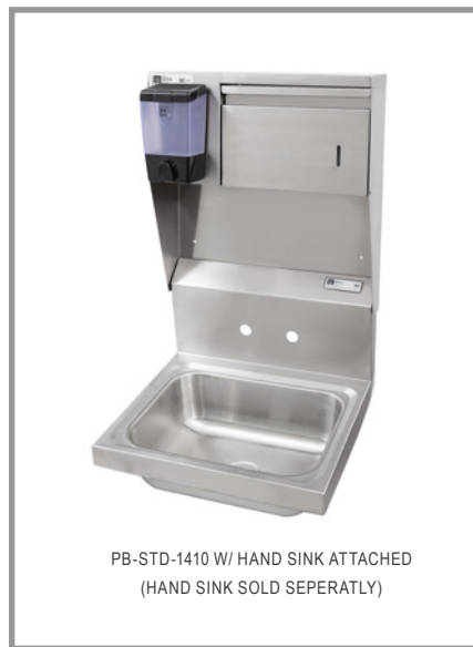
PB-STD-1410 W/ HAND SINK ATTACHED (HAND SINK SOLD SEPERATLY)