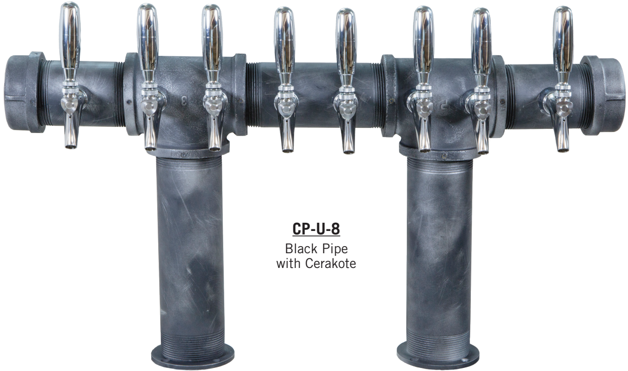
CP-U-8 Black Pipe with Cerakote