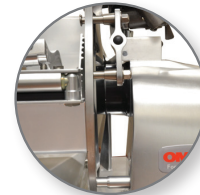
Designed for Easy-cleaning