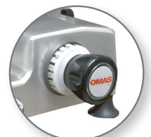
Slice Thickness Control