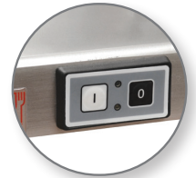
Control Push Button (NVR Switch)