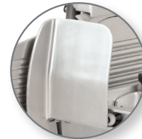
Aluminum Thumb Guard