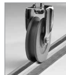
Grooved Caster on Track