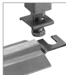
Raised Floor Track