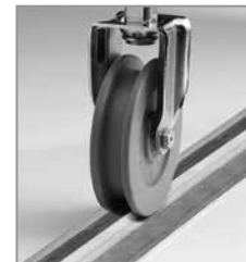
Grooved Caster on Track